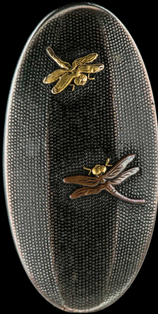
kojiri (end cap)

The samurai revered the dragonfly. For when they flew, they flew forward, and never retreated.