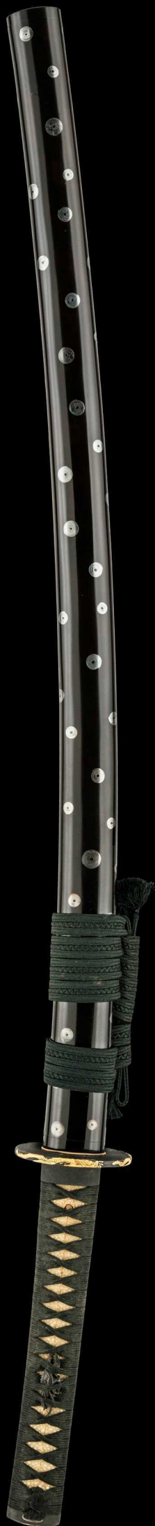
Late Edo period uchigatana koshirae (early-mid 1800s)