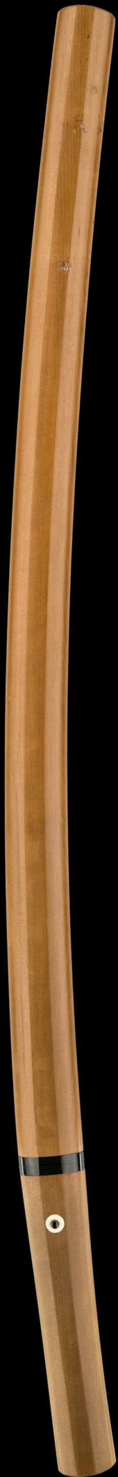
Shirasaya (protective scabbard)