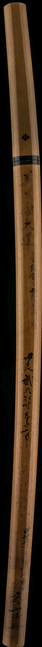
Shirasaya with Sayagaki