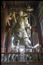
Tamonten statue (Todai-ji, Nara)

He is believed to live halfway down Mount Sumeru.