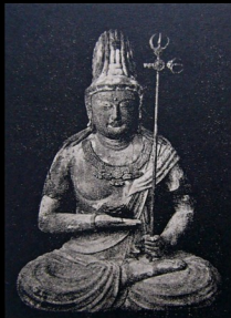
Kokuzo Bosatsu statue in Jingo-ji, Kyoto 9th century